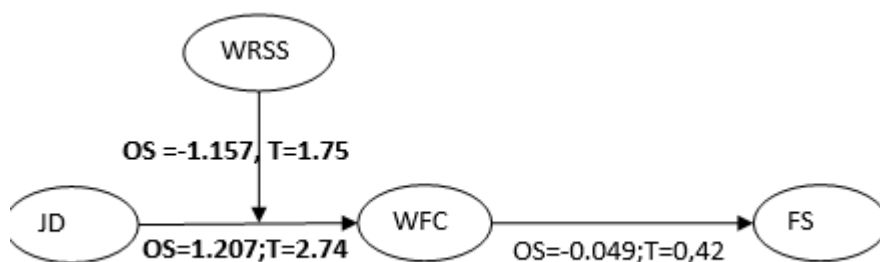
Figure 2. Significance Test Results path coefesien.

Based on the significance test path coefesien The statistical data can be depicted in the picture above. It is known that there is a significant influence job demand to work family conflict with a t-statistic value of 2.74 and original sample 1.207. There is a non-significant effect work family conflict to family satisfaction with T statistic results of 0.42 and original sample 0.049. while significant results were also obtained for the moderating effect of WRSS on the relationship job demand and work family conflict with a T statistic of 1.75 and original sample amounting to 1,157.