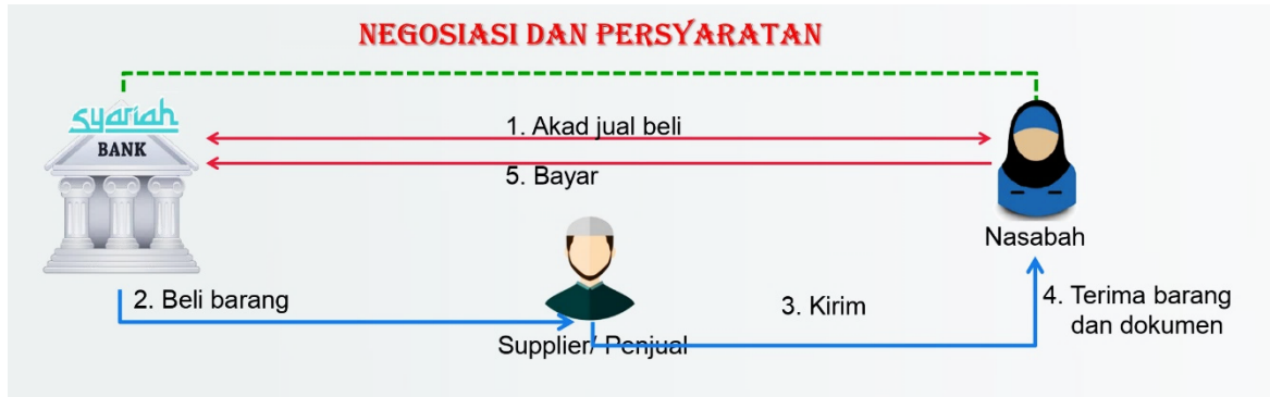
Figure 2. Sale and Purchase Bay' Contract