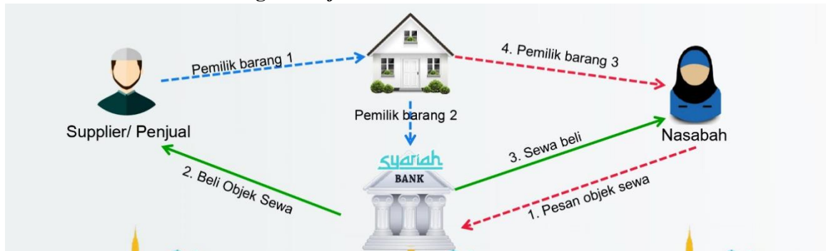
Figure 3. Ijarah Muntahia Bit Tamlik Contract

From the illustration above, it can be explained that a consumer in the case of a musytari (buyer) who has chosen a plot of land and makes a payment of a booking fee and a DP of 20% to the bain (the seller) makes the payment process whether it is taken by the officer, deposited directly to the office or via bank as a mediator for installment payments or installments in the following month. After signing the SPPT and SPT between musytari and bain , the object of the contract ( mabi' ) is the approval of goods traded with tsaman (price) whether it is done in cash or credit ( bay at-taqsit ).