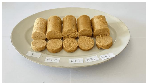
Figure 2. Appearance of meat analogue (MA) compared to chicken meat (R)

in imitation meat is generally related to the occurrence of the Maillard reaction during processing involves a heating process 24,25 . The Maillard reaction occurs between the free carbonyl group of the reducing sugar and amino acids and forms a covalent bond to produce melanoidin that is brown in color 24 . The intensity of the brown colour tends to increase as the proportion of glucomannan increases. Glucomannan is a polysaccharide of the hemicellulose type composed of galactose, glucose, and mannose monomers. The source of the carbonyl group as a substrate for the Maillard reaction is found in the monomers that make up glucomannan.