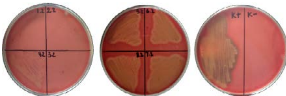
Figure 2 : Dilution test result cultured into Blood Agar Plate. In 1.2 (80%), 2.2 (40%), and 3.2 (20%) culture there were no growth of S. pyogenes meanwhile in 4.2 (10%), 5.2 (5%), 6.2 (2,5%), 7.2 (1,25%), 8.2 (0.625%) there were growth of S. pyogenes .