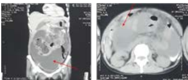
Figure 3. Abdominal CT scan showed extraluminal and loculated free fluid intensity, with contrast enhancement at abdomen cavity and pelvic cavity (arrow)