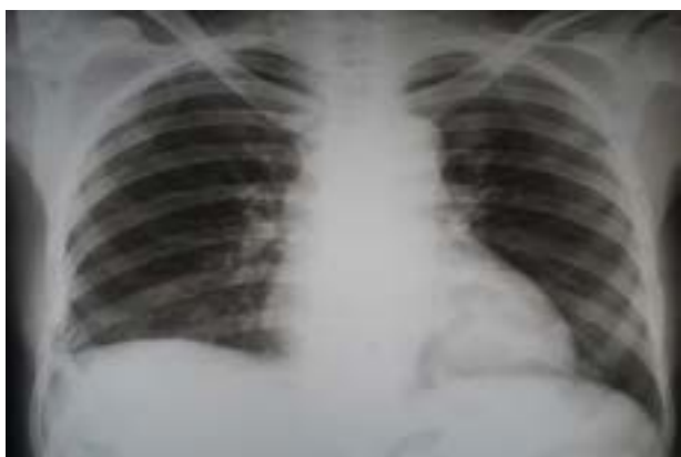
Figure 1. Chest x-ray of patient showed no sign of pulmonary tuberculosis