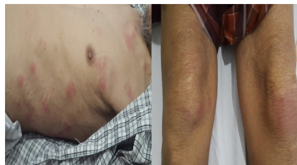
Figure 2. Case 3. a. Warm and tender erythematous maculae (arrows). B. Bilateral knee joint effusions (arrows).