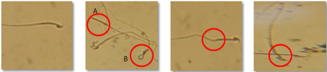
Figure 1. Spermatozoa morphology in adult mice with normal (N) and abnormal (A: head malformation (like needle); B: bent midpiece or tail; C: broken tail; bigger head)

b Significantly different ( P < 0.05 ) between C. nardus treatment group and positive control group (in rows).