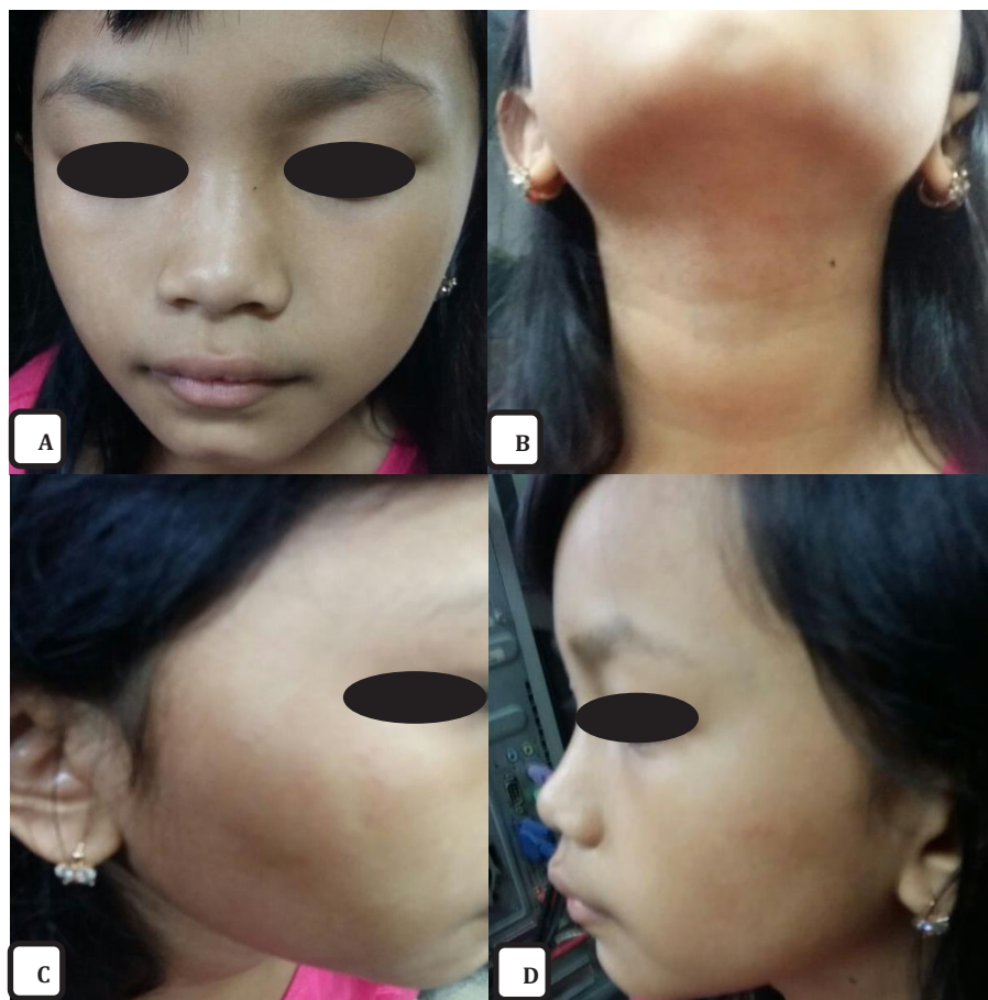
Figure 5. After Treatment: (A,B,C, and D): Good progress of the lesion 4 weeks after treatment, there were post inflammatory hypopigmented macule (KOH examination was negative)