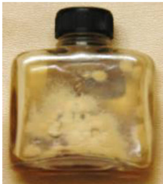
Figure 3. Macroscopic appearance of the colonie of M. gypseum in culture media, there were flat and granular with tan to buff pigment appearance.