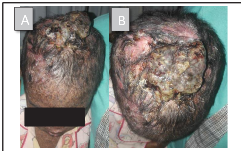
Figure 4. A and B. Large ulcer of malignant melanoma after receiving two cycles of chemotherapy. The size was smaller than before but the lesion became more ulcerative.