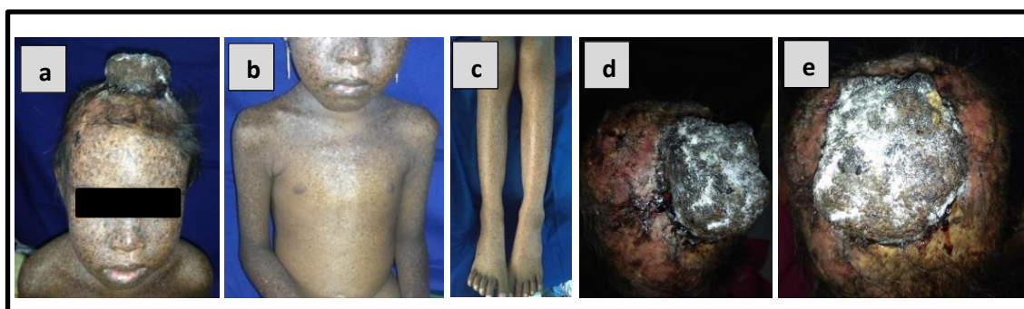
Figure 1. Dermatological state before the treatment. (a). Multiple hypopigmented and hyperpigmented macules on facial region (b,c). Xeroderma pigmentosum lesion on the trunk and extremity region (d,e). Large ulcer malignant melanoma on the vertex region.

The physical examination showed she was pale, suffered from poor nutrition, and her body weight was less than normal. There were multiple lymph nodes enlargement in submandibular dextra, upper-mid jugular sinistra, and lower jugular sinistra. The dermatological state on region generalisata showed multiple hypopigmented and hyperpigmentation macules unsharply margined, especially over the sun-exposed areas. A solitary tumor 25x6x5 cm 3 in size was observed over the vertex region. The surface showed extensive ulcero-proliferative, with areas of hemorrhage and blackish pigmentation, crusting, and there is some slough and easy to bleed on contact (Figure 1).