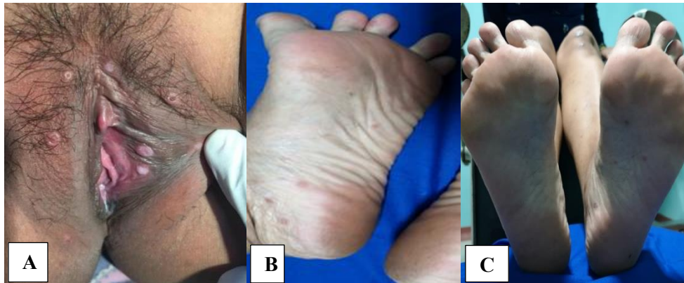
Figure 1. A. Multiple flat-topped papules, well-demarcated, moist, whitish over labia mayora, labia minora. B and C. Multiple erythematous maculopapular, annular, well-demarcated covered with a thin scale on plantar pedis sinistra

Physical examination over the labia mayora et minora showed that there were multiple flat-topped papules well-demarcated, moist, whitish colored with the greyish white vaginal discharge homogenous, stick to the vaginal wall. In plantar pedis sinistra, there were multiple erythematous maculopapular, annular, well-demarcated covered with thin scale.