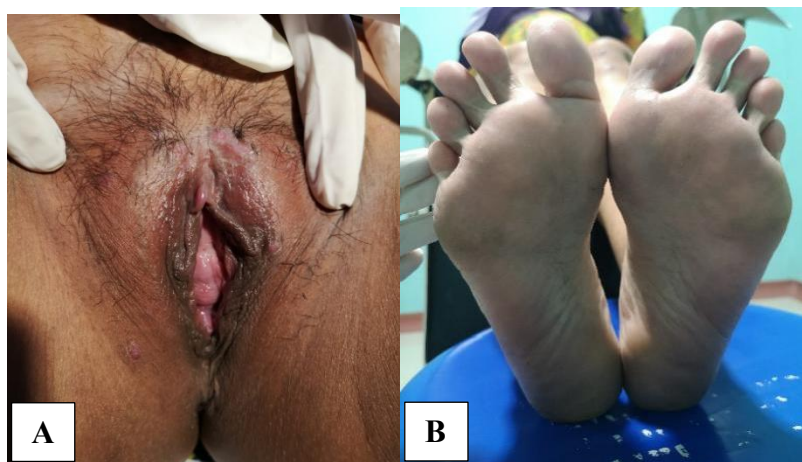
Figure 3. Improvement after 1 month treatment there is no condyloma lata and roseola Syphilitica.