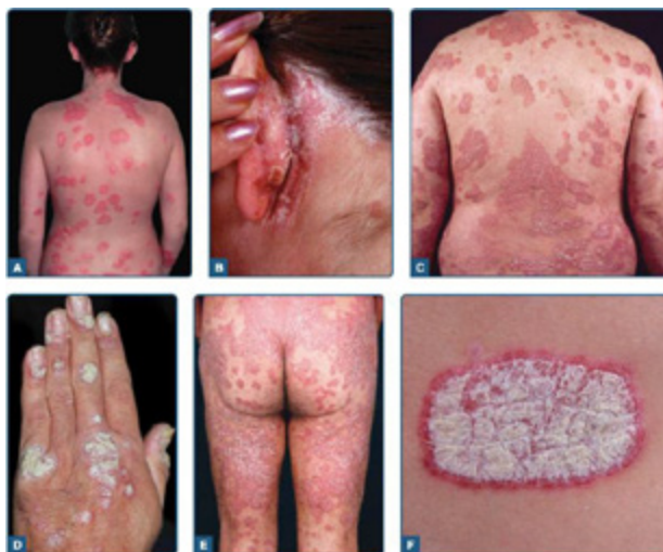
Figure 2. The clinical picture of plaque psoriasis. 4

(CASPAR), The Disease Activity Index for Psoriatic Arthritis (DAPSA), and Psoriatic Arthritis Disease Activity Score (PASDAS). 10