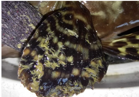
Figure 1. Cantang groupers infested with the Zeylanicobdella parasite on pectoral fin