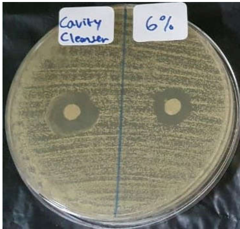
Figure 1. The results of differences in the inhibition zone of cocoa peel extract 6% and CHX 2% (cavity cleanser) against Streptococcus mutans .