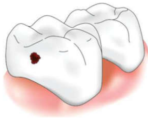
Figure 1. Class II caries on the proximal surface of molars and premolars. 33