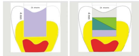
Figure 3. Bulkfill resin filling up to 4 mm deep. A. Simultaneously into a 4 mm deep cavity. B. Oblique incrementally. 34

Flowable resins from bulkfill have less filler than traditional ones. The proximal feature of Class II restoration carried out with flowable bulkfill resins did not occur with traditional resins. This damage causes proximal, long-term loss due to material loss, better absorption of water and resin hydrolysis due to material degradation. After one week, post-treatment sensitivity occurred in the patient. The clinical trial findings indicate that sensitivity occurs within the first three weeks due to changes in temperature and occlusal forces. Sensitivity during the restorative procedure is not purely arbitrary since it may be linked to irrigation during tooth preparation to excessive dentin drying during the bonding procedure and may also be