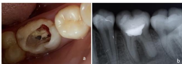
Figure 1. a.clinical view b. periapical radiograph on 36.

The root canal preparation is done using Protaper Next to X2 files on all root canals, after h a try-in photo