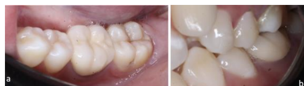
Figure 5. a. occlusal view after crown sementation b. crown in relation in occlusion.