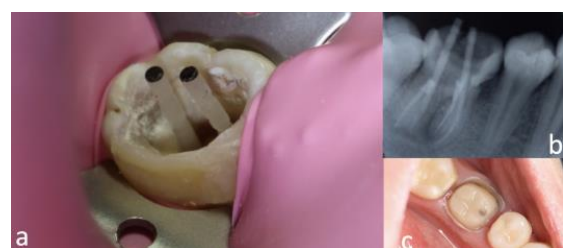
Figure 4. a. fiber post trial clinical view b. fiber post periapical radiograph placement confirmation. c. 36 after fiber post cementation and build up.