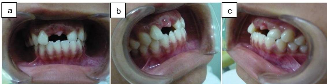
Figure 2. (a). Teeth 11, 21 (avulsion) and vital teeth 12 (rotation) and tooth 22 crossbite, (b) Right side view, (c) Left side view.

Root canal treatment for teeth 12 and 22 were performed with one visit endodontic treatment using a crown down pressureless (CDP) preparation technique using the