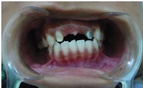
Figure 3. Insertion of a fabricated post for tooth 22 and insertion of a prefabricated post for tooth 12.

Root canal impression of tooth 22 was carried out using elastomeric impression material for manufacturing fabricated posts (cast posts) and cores manufactured in the dental laboratory. The purpose of this cast peg is to improve inclination, overbite, and overjet. After that, the cast post and core of tooth 22 using GIC type I (Luting cement). Then the preparation was carried out on each core of teeth 12 and 22 on the same day to obtain good alignment of the position and arch of the jaw and facilitate insertion—fixed-fixed bridge four units (12, 11, 21, and 22) (Figure 3).