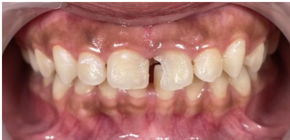
Figure 1. Initial clinical presentation (labial view).

In the first visit, anamnesis was conducted, followed by objective examination, supplementary examination, informed consent, and the patient signed the informed