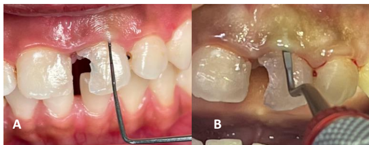
Figure 3. A. Probing examination, B. Bone sounding examination.