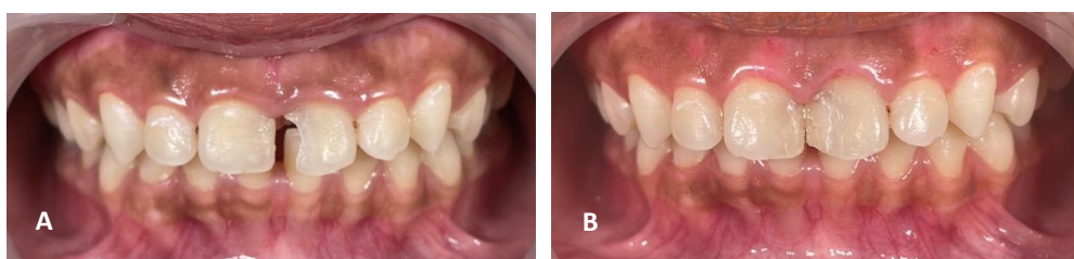
Figure 5. Clinical photos: A. before treatment and B. after treatment.