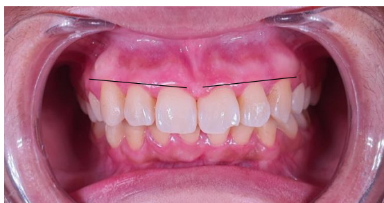
Figure 3. Clinical view 3 weeks after calculus removal.

consent and informed consent forms. Intraoral examination of tooth 11 revealed a gingival sulcus depth of 2 mm using a probe, with a bone sounding depth of 4 mm. Subsequently, tooth 21 exhibited a gingival sulcus depth of 2.5 mm, with a bone sounding depth of 5 mm (Figure 4). Digital Smile Design (DSD) was conducted using the Medit application, resulting an initial width and height ratio of 90% for teeth 11 and 21. To correct the gum line margin height and achieve the ideal width and height ratio of 80%, based on probing and bone sounding results, a 1 mm reduction in gingival margin was indicated for teeth 11 and 21 (Figure 5).