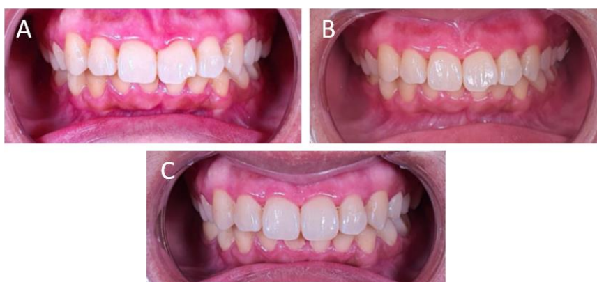
Figure 7. Initial clinical photograph (A); Clinical photograph at 13-day follow-up post crown lengthening (B); Clinical photograph after composite filling procedure on tooth 21 (C).