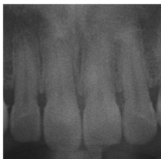
Figure 2. Radiographic image showing the alveolar crest distant from the CEJ (Cemento-Enamel Junction).

On the second visit after calculus removal, DHE and KIE were conducted, along with completing the inform to