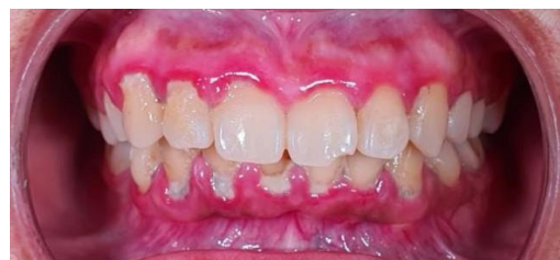
Figure 1. Clinical view before calculus removal.

in the affected tooth. The patient has no history of systemic diseases or drug allergies. Extra-oral examination revealed no abnormalities. Intra-oral examination showed Ellis class 1 fracture on the incisal-distal aspect of tooth 21. The patient has poor oral hygiene with visible calculus deposits on the upper and lower jaw teeth regions. The gingiva is hyperplastic, red, easily bleeds, and the gingival margin appears lower on teeth 11 and 21 compared to teeth 12 and 22 (Figure 1). Radiographic examination showed the alveolar crest distant from the CEJ is still normal (Figure 2).