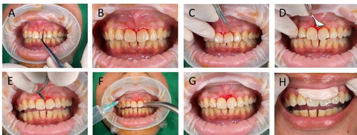
Figure 6. Pocket marker forceps (A); Bleeding point (B); External bevel incision (C); Facial contouring using Kirkland (D); Interdental contouring using Orban (E); Saline irrigation (F); Final result of crown lengthening (G); Placement of periodontal pack (H).

The upper central incisor is considered the primary reference tooth, more critical than other anterior teeth in terms of visible crown structure. 4 For aesthetic purposes, upper anterior teeth should be proportional to facial morphology. 5 Ideally, the upper central incisor should have a width and height ratio of around 80%, although reported ratios vary between 66% and 80%. A golden standard for the width and height ratio of upper central incisors in the range of 75% to 80% is found in 20.4% of the population, influenced by racial and gender factors, with males typically having wider width and height ratios compared to females. 6