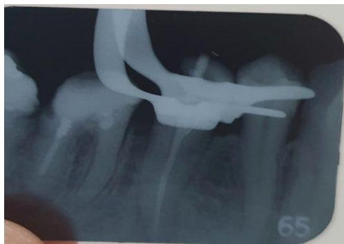
Figure 3. Final endodontic retreatment.