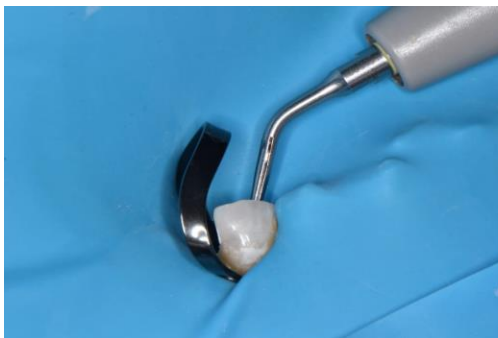
Figure 2. Removing old metal post using Satelec.