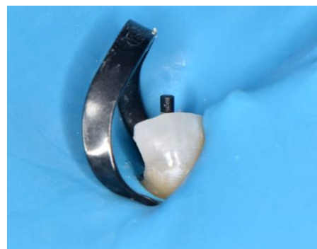
Figure 4. Try in fiber post.