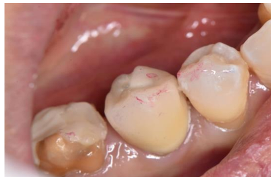
Figure 6. Final restoration.