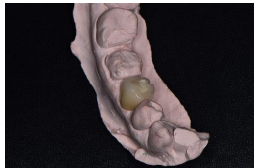
Figure 5. PFM restoration.