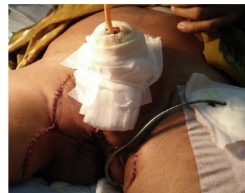
Figure 5. After skin graft procedure.

On the 35 th day of admission, the patient had undergone plastic procedure (closure of the defect with thick STSG (Split Thickness Skin Grafts) and bilateral pudendal perforator artery flap). After one week of the closure of the defect, the flap was in good condition: viable, warm, and the color was the same as the surrounding skin (Figure 5).