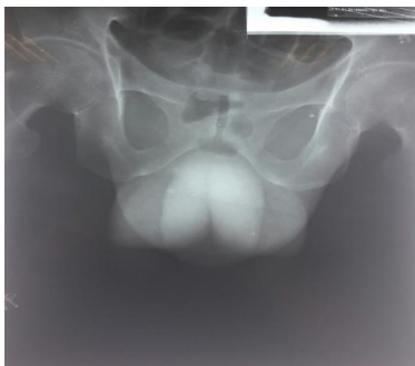
Figure 2. Pelvic x-ray showed gas formation in scrotal area.

Interdepartmental consultations, 1) Urology: the patient was diagnosed with Fournier gangrene, suggested to perform necrotomy and debridement; 2) Digestive: the patient was diagnosed with perianal abscesses, the patient was planned to undergo an emergency incision and drainage procedure.