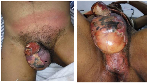
Figure 1. Initial physical examination

1, SO 2 96.3%. ECG: sinus rhythm 108x/minute, normal axis. Chest x-ray was normal. The pelvic x-ray showed the present of gas forming in scrotal area (Figure 2).