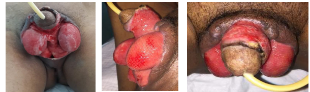
Figure 4. On third day of wound care

On the 4 th day of admission, the patient complained of surgical wound pain, and fever became better. Vital signs were within normal limit. The patient had a perianal drain and rectal tube, and wound condition showed in Figure 4 on the third day of wound care. The wound was in good condition, with no pus, and visible granulation tissue. Urine production was 1,500 ml/24 h. Laboratory finding: FPG 297 mg/dl; albumin 2.13 g/dl. The pus culture result: Staphylococcus aureus dan Klebsiella pneumoniae , resistance for ceftriaxone. The tissue culture result: Staphylococcus pasteurii . The patient was then given cefotaxime 1 gram/8 h based on sensitive culture result, basal insulin 10 unit subcutaneous injection once daily, and albumin transfusion.