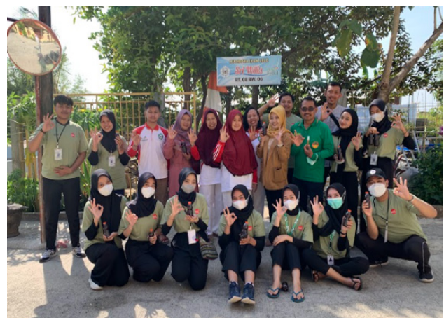
Figure 4. Eco-enzymes Manufacturing Process Based Community

Based on Table 2, it is also obtained information that before community service activities were carried out, 37 (82%) respondents did not know the benefits of eco-enzymes and after community service activities respondents who had good knowledge increased to 39 (87%) respondents. The following is documentation of community service activities carried out: