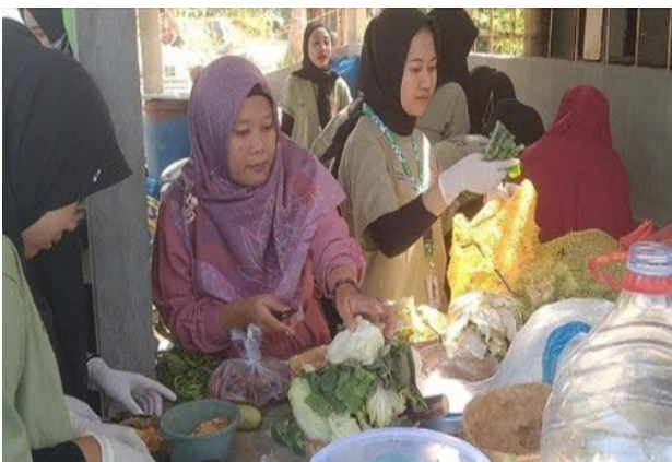
Figure 3. Eco-enzymes Manufacturing Process

Table 2 also shows that 77.78% of respondents did not know how to make eco-enzymes before the training, but after the training, 80% of respondents had a good understanding of the process. Figure 3 shows the implementation of training and field practice in making eco-enzymes.