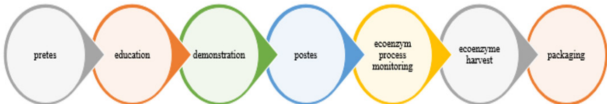
Figure 1. Stages of Community-Based Eco-enzymes Making Activity

effective and sustainable waste management ( Bank Sampah Sri Wilis, 2024 ). Through collaborative activities in making eco-enzymes by utilizing household organic waste aims to minimize the quantity of household organic waste produced. This activity was carried out through 4 stages, as shown in Figure 1.