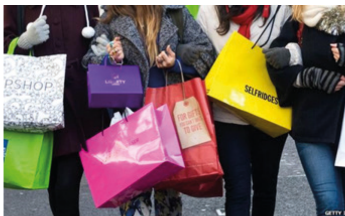
Figure 2. Consumptive lifestyle

science. The existence of cultural acculturation, as a result of which people are able to understand and apply positive aspects of a new culture. The use of foreign languages in communication helps to broaden the public's understanding and acceptance of new ideas for the advancement of science and technology. However, westernization also poses a hidden danger in the form of a diminished sense of nationalism, the introduction of western ideas that can harm the nation's morals, people's lifestyles becoming more consumptive, people preferring everything instant, and a lack of enthusiasm for their own culture (as illustrated in Figure 2). The concept of liberalism that Western culture has adopted is incompatible with national culture. People's behavior is becoming more individualistic, and the family spirit is fading. There is a deviant attitude that is contrary to Indonesian norms.