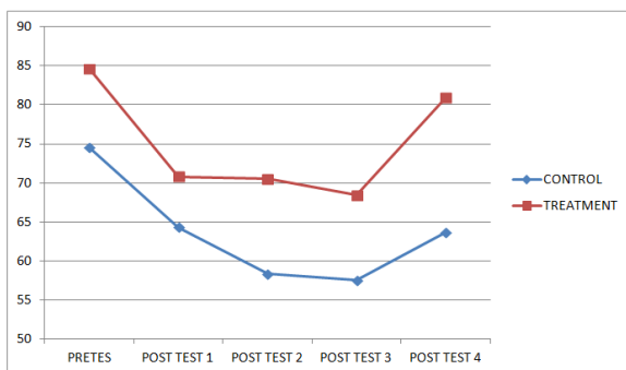
Fig. 2. Leg muscle strength.

The result of paired t test of knee joint ROM in control group showed decreased ROM after 1 hour, 24 hours, 48 hours and 72 hours post eccentric activity. However at 72 hours an increase in ROM from 24 hours and 48 hours. In treatment group, the decline in ROM also occurred at 1 hour, 24 hours, 48 hours and 72 hours after eccentric activity. However, at 72 hours, the increase occurred from 1 hour, 24 hours and 48 hours (Fig. 3, Table 5).