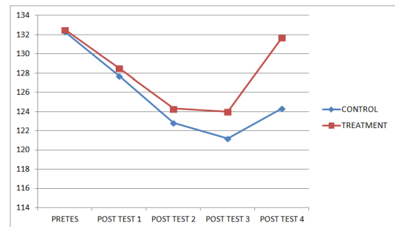
Fig. 3. Knee joint ROM.

Table 6 shows that the difference in leg muscle strength 1 hour after and before activity between control and treatment groups did not differ significantly (p=0.129). At 24 hours after eccentric activity, leg muscle strength between control and treatment groups also did not differ significantly. This was indicated by delta 5 with p value 0.078. It also occurred 48 hours after eccentric activity, when leg muscle strength between control and treatment groups also did not differ significantly, as indicated by delta 6 with p=0.161. But at 72 hours after eccentric activity, leg muscle strength between control and