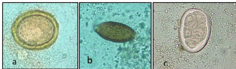
Fig. 1. Morphology of egg per species, identification by Kato-kats Thick smear using malachite green. Observation under light microscope 40x objective (Olympus, Tokyo, Japan) (a) A.lumbricoides fertilized egg, (b) T. trichiura egg (c) Hookworm egg.

The total IgE level is normally distributed while the EPG is not normally distributed, so the Spearman correlation test is used to test the correlation between total IgE level and EPG. There was correlation of total IgE level and EPG ( r = 0.667 p = 0.001 ). The correlation between total IgE and EPG was then analyzed using linear regression to determine the extent to which the EPG affected total IgE levels. The results are shown in Figure 2, with the equation y = 2,3x + 267 ( p = 0.001 ).