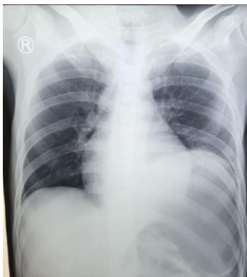
Figure 2. Abdominal CT-Scan with contrast examination indicating a mass in the left renal fossa