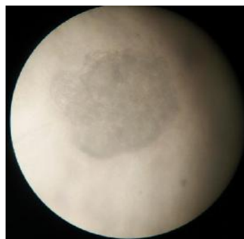
Fig. 2. Oocyte with cumulus oophorus observed under inverted microscop 200x magnification

Female mice undergoing ovulation showed two fertilization pouches in the right dan left sides of the oviduct. When the fertilization pouches were opened, there were some oocytes. The data result of counted oocyte number and collection on female mice under inverted microscop are shown in Table 1. Statistical test using SPSS program showed that there was significant value (p value=0.000). It means that the oocyte number between control and exposure groups was significantly different.