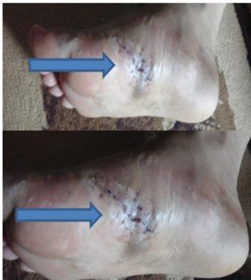
Fig 3. Clinical feature one month after surgery.