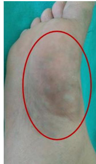
Fig 1. Clinical performance of the mass.

This is a case report of a 19-year-old Indonesian male presented with a chief complaint a painful mass on his plantar medial right foot that had been present for two weeks and had increased in size. Weight-bearing activities exacerbated the pain. He had no previous treatment other than walking on the outside of his feet to avoid direct contact with the mass. He denied any trauma to the area. The patient reported that mass already appeared since baby but small and painless. Physical examination revealed a large plantar medial mass, with size \pm 8 \times 5 cm approximately, slightly mobile, bluish, soft, and non-compressible. The mass was pulsatile on palpation and no bruit. The cutaneous stain was more erythematous and local warmth (Fig. 1). The patient's remaining pedal neurovascular and musculoskeletal examinations were within normal limits.