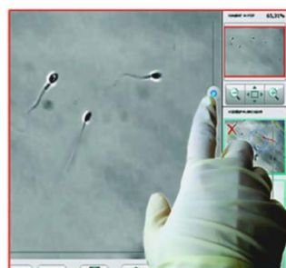
Figure 1. Sperm selection for ICSI using RI ICSI.

Image analysis software for highlighting of the most fertile sperm by color automatically has been marketed (see: https://www.radicalindia.com/life-ICSI.php ). However, no publication found about the result of the ICSI result between this computerized and manual sperm selection.