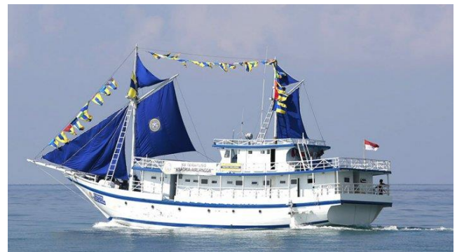
Figure 1. Ksatria Airlangga Floating Hospital (RST-KA)

protocol is implemented in the non-conventional hospital health facility such as Ksatria Airlangga Floating Hospital (RST-KA), which is a non-permanent mobile hospital in the form of the sailboat, that focused on the surgery service administration for regions with an inadequate health facility. In this series of case reports, four cases will be presented where 2 cases are the implementation of ERAS protocol and 2 cases are the conventional protocol on the social service concept in RST-KA.