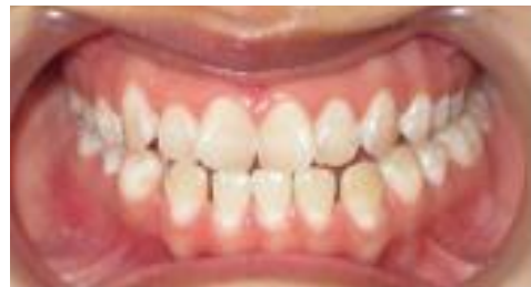
Figure 2. multiple diastema with agenesis of lateral mandibular incisor

The treatment began by installing fixed orthodontic appliances (MBT slot bracket 0.022) for tooth 43 using bracket 42 and bracket 43 for tooth 44. This was to replace tooth 42 with 43 and tooth 43 with 44 considering that the patient's tooth 43 had similar shape and size to tooth 42. The treatment was then followed with leveling and alignment