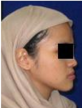
Figure 1. a concave facial profile of the patient

The panoramic photographs showed 28 impacted teeth, tooth 38 was extracted, and tooth 42 was agenesis (Figure