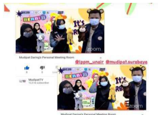
Figure 1. Story Telling of the Community Service Team at SD Muhammadiyah 4 Surabaya

Story telling activities are carried out by telling stories to students using hand puppets. This story telling activity has become a routine SD activity Muhammadiyah 4 Surabaya for entertainment media for students on the side lines of online schools. Target of this activity are students in grade 1, grade 2, and grade 3 at SD Muhammadiyah because it was assessed that children with this age range still like this kind of storytelling activity. However, this activity is also open to the public who want to watch Story telling.