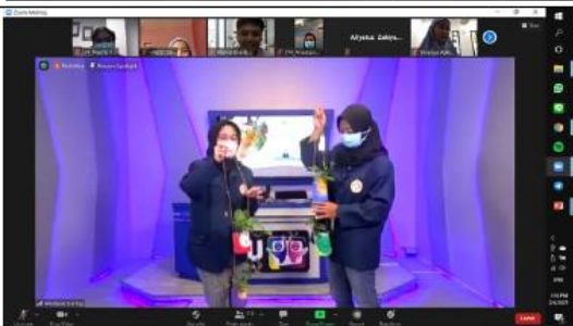
Figure 4. Empowerment activities

Based on the results of the pre-test ini Table 1 about the readiness to release the child during the teaching and learning process carried out offline in the midst of the Covid-19 Pandemic dominated by the answer “Very unprepared” with a percentage of 43.80% of 121 respondents while the post-test answers dominated by “prepared” answers as many as 30.43% of 23 respondents. In addition, respondents the percentage of those who choose the “Ready” option in the post-test is higher, namely 26.09% from 23 respondents compared to the pre-test which was only 7.44% of 121 respondents.