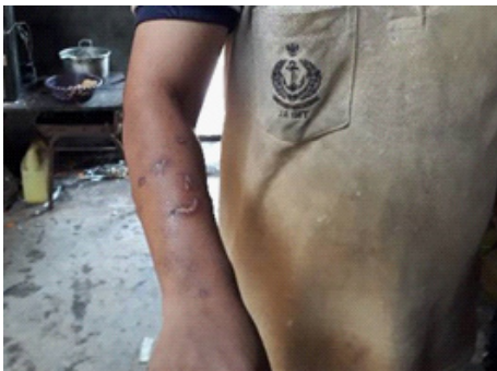
Figure 2. Contact Dermatitis in Electroplating Home Industry workers in Durungbanjar Village

The results of the distribution of workers with contact dermatitis at the Electroplating Home Industry in Durungbanjar Village is displayed in