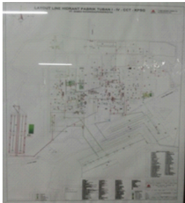
Figure 2. A layout of hydrant in the Cement Company in 2017