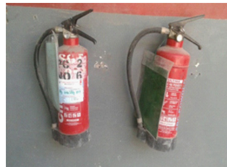
Figure 3. The Condition of Fire Extinguishers in the Cement Company in 2017

and quantity of PPE are sufficient. Moreover, the company has always carried out PPE checks and tests regularly to make sure the PPE are ready to use. The need for personal protective equipment provided has been suitable with workers. The personal protective equipment provides breathing apparatus and oxygen lines, chemical resistant clothing, fire resistant clothing, fire resistant gloves, and boots. Meanwhile, the inspection and maintenance are carried out every day by the Occupational Safety and Health Department.