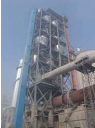
Figure 1. A Rotary Klin in the Cement Company in 2017