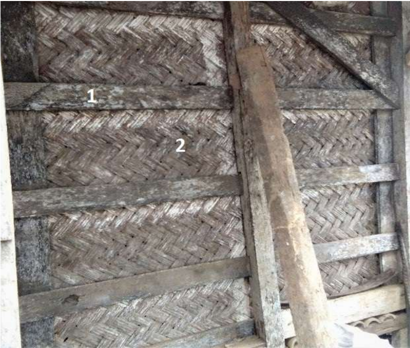
Figure 4 Parts; 1) pane'er , and 2) chamber of kepang tanyjer