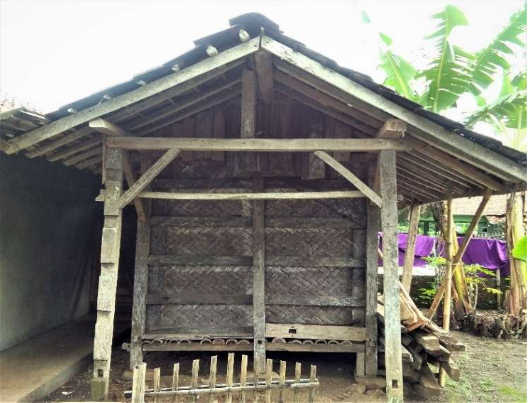
Figure 2 Leuit induk Suka Puyuh