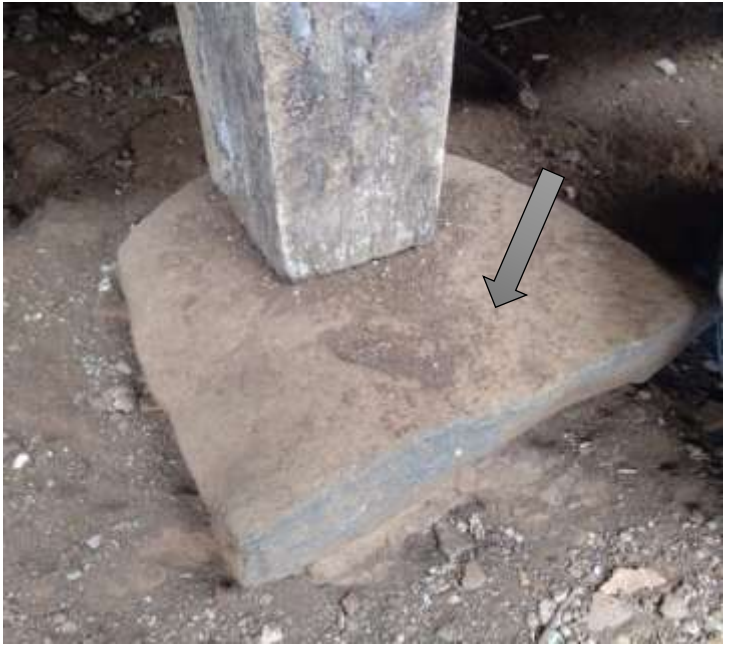
Figure 5 The arrow points to the shape of tatapakan

The Leuit only has one space, which is used to store rice. The rice put into Leuit is not like rice in general, but a type of huma rice. Often, huma rice is referred to as field rice because the cultivation