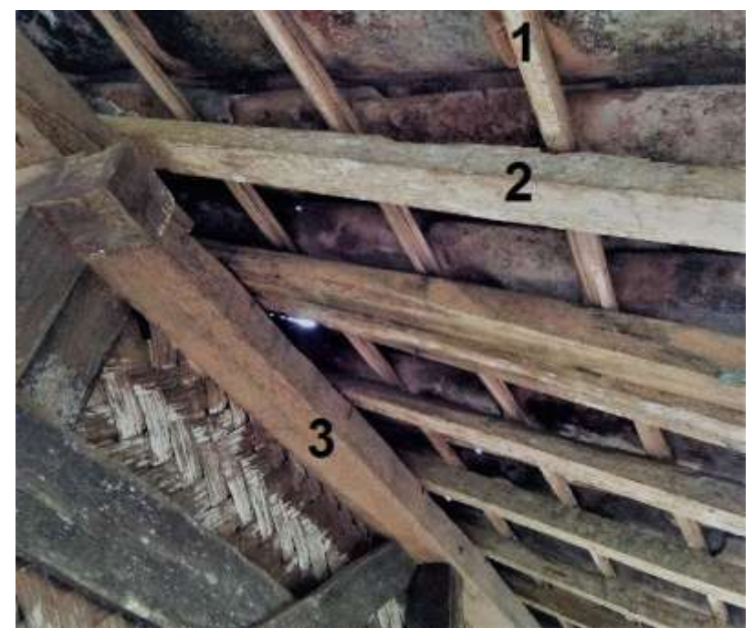
Figure 3 Parts; 1) reng, 2) usuk, and 3) pamikul