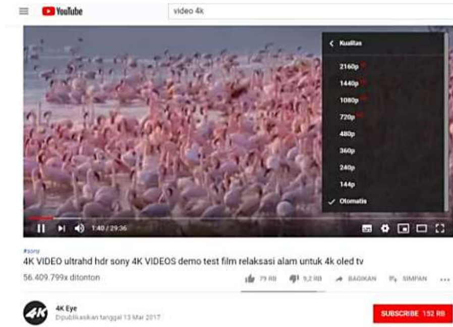
Figure 1. Some of the technology features in the YouTube user interface (youtube.com)