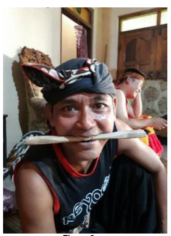
Figure 2. Cokotan used by the dancer (pembarong) to help him holding the heavy mask by his teeth

Pickles divided tooth wear into two types: tooth wear caused by chemicals and physical contact (Pickles 2006). Erosion is a type of wear induced by chemicals, whereas abrasion and attrition are types of wear caused by physical contact. He went on to say that tooth wear induced by physical contact and chemicals that destroy the hard tissues of the teeth might appear in different forms and combinations in different people. The phrase "tooth wear" is more convenient to use because it encompasses all of the different reasons of hard tooth tissue loss.