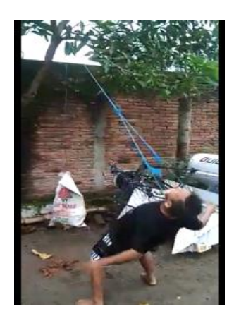
Figure 3. Pembarong holding the heavy mask by his teeth