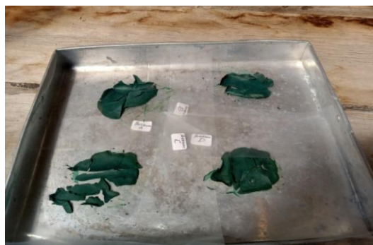
Figure 3. Clinical sign of shrimp infected by V. parahaemolyticus . Description : (A1) sick shrimp, (A2) normal shrimp, (B) empty intestine, (C) the uropod turned red and the gnats.

TSP) of 0.414 grams, while the lowest treatment was found in treatment A (0.4 g/l Urea + 0.008 g/l TSP) of 0.410 grams but there was no significant difference between each treatment ( P > 0,05 ). The biomass form of Spirulina sp. can be seen in Figure 3.