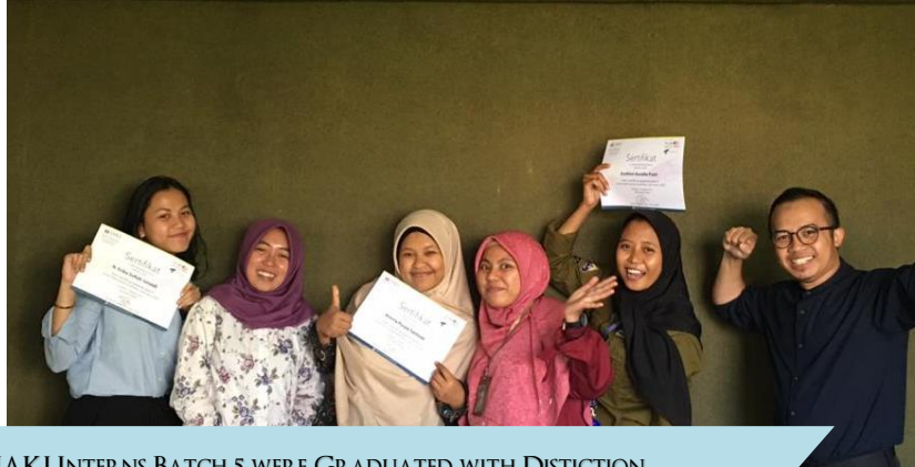
JAKI INTERNS BATCH 5 WERE GRADUATED WITH DISTICTION