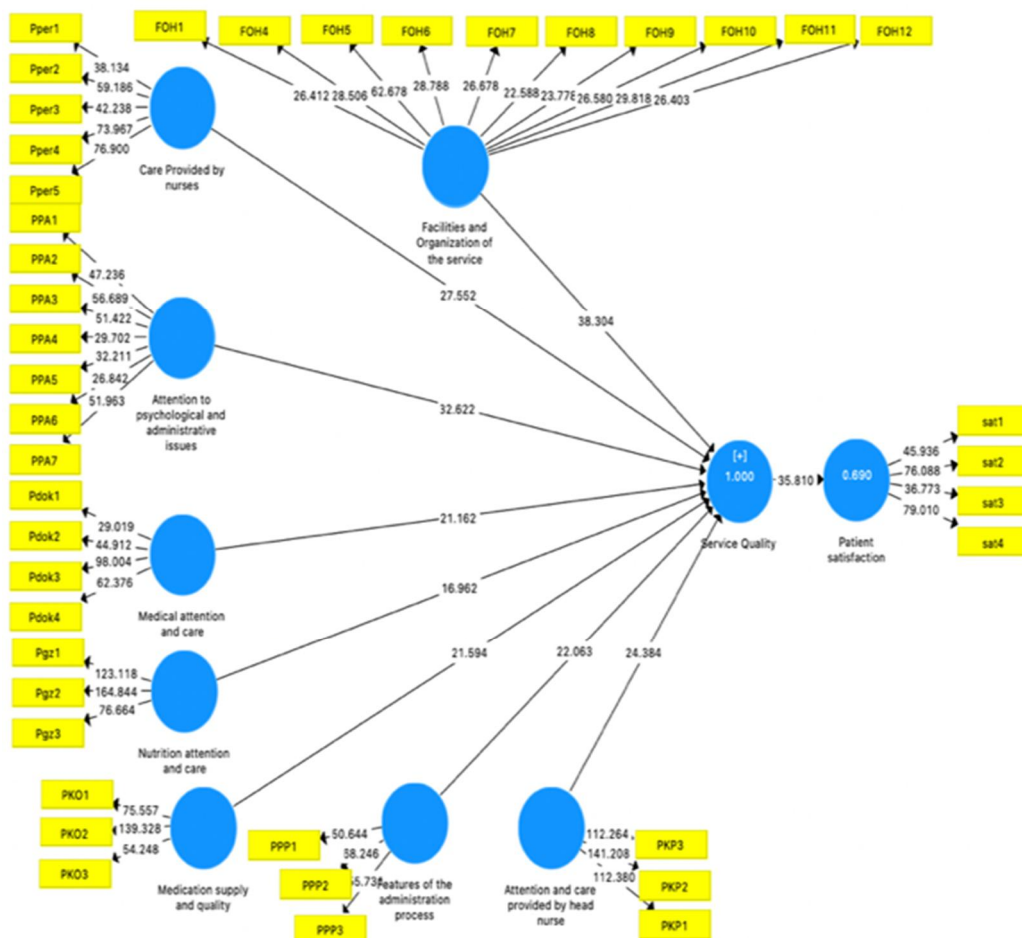
Figure 2. Inner Research Model Results

The image of the inner model shows the T-statistic values of the 9 paths in the research model. All of the paths whose T-statistic values are above the t-table were significant. From the structural model analysis on the values of R 2 and Q 2 , this research model was in a moderate to a strong category on the dependent variable on the service quality variable. It had a strong predictive accuracy on the effect of service quality variable on patient satisfaction variable.