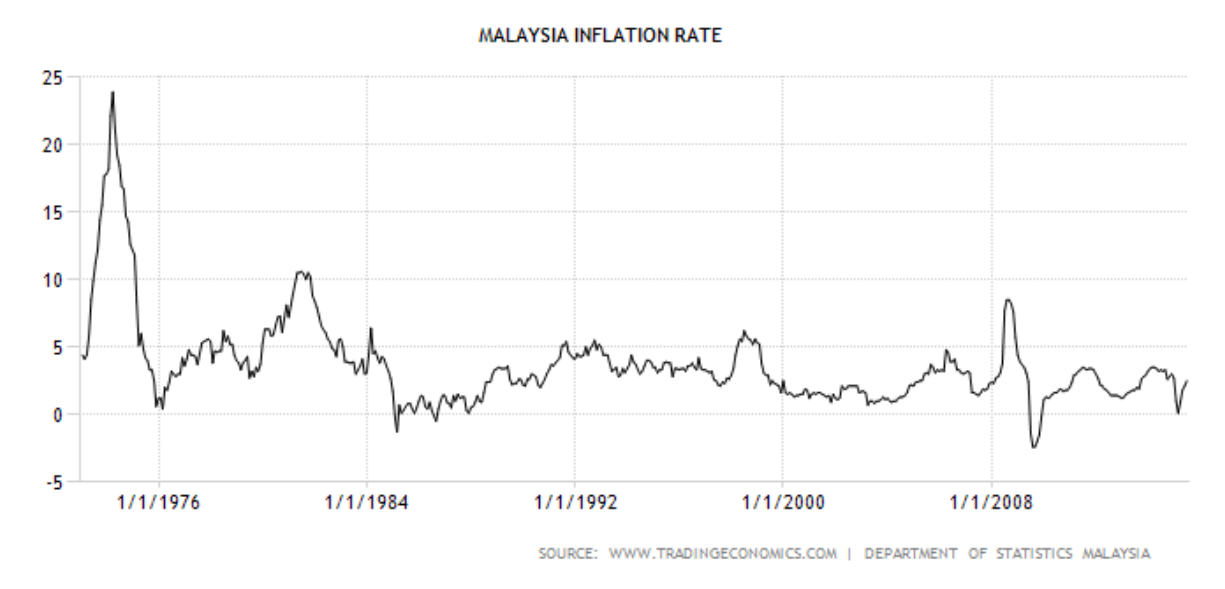
Figure 1. Malaysia Inflation Rate

Following the global financial crisis in 1997/1998, the Malaysian government had instituted various macroeconomic stabilization policies. Apart from introducing two rescue packages of fiscal stimuli totaling RM67 billion (US$18.1 billion), the government had also strived to retain the inflation under control. However, in view of the increasing energy prices, inflationary pressure has been increasing since 2008. Despite the rising inflation rate, Bank Negara Malaysia (BNM) had tried to maintain the interest rate unchanged at 3.5% until late-2008 to support the economic activities. At all times, BNM had been vigilant towards inflationary threats as the impact of inflation could be damaging to the real economy. The table below shows that inflation rate in Malaysia had been relatively stable in general. It peaked to roughly 8 percent during the global crisis and calmed down, even disinflation afterward. However, in the early 2011, inflation rate kept increasing.