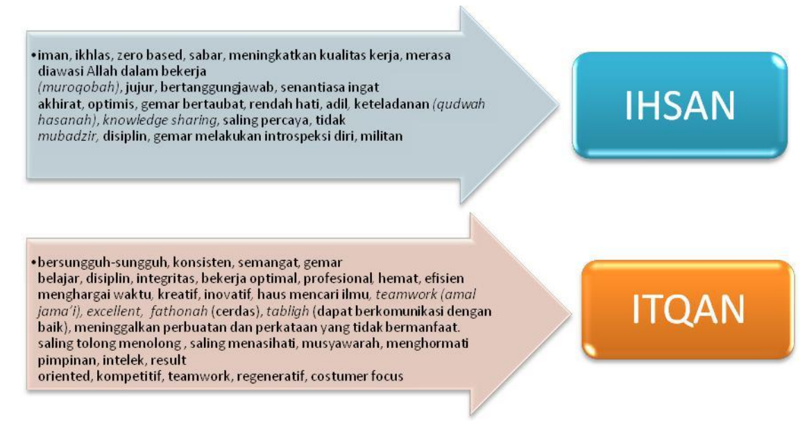
Figure 1 The values of Islamic Corporate Culture is hence simplified into two main values; Ihsan and Itqan

Through a review of different literatures describing various corporate cultural values presented by the experts in the description above, the researcher believes that the values derived from Islamic values above can be simplified into two main values of the Islamic corporate culture, they are: ihsan and Itqan .