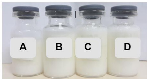
Figure 1. NLC systems (A) formula 1; (B) formula 2; (C) formula 3; (D) formula 4

The organoleptic observation showed that the NLC was white, odorless, had a liquid consistency and soft texture, as shown in Figure 1.