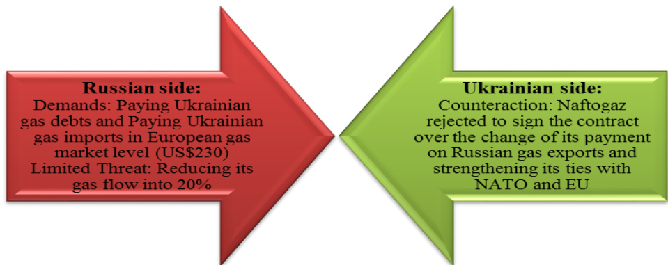
Picture 4. Ultimatum Approach of Russia's Coercive Diplomacy Implementation