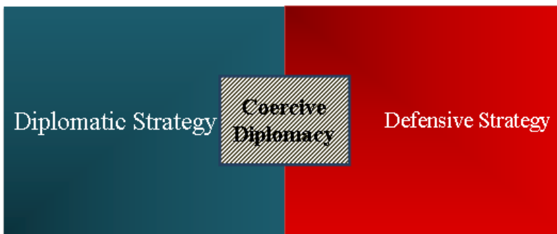
Picture 1. Matrix of Coercive Diplomacy Conception

There are two (2) types of extreme “variants” or methods on applying coercive diplomatic strategy (in Coercive Diplomacy: Integral Element of Diplomatic Negotiations , 2012) those are (1) Try-and-see approach and (2) Ultimatum approach (consists of 3 components, they are demand, threat and time pressure)