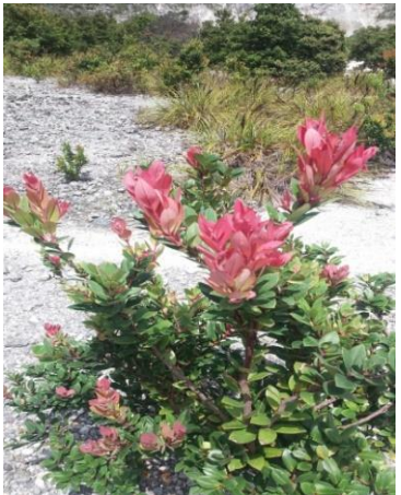
Figure 1. Cantigi plant with young leaves (red) and old leaves (green)

Cantigi ( Vaccinium varingiaefolium (Blume) Miq has young leaves with color of red and old leaves with color of green (Figure 1). The red ones had stronger antioxidant activity ( IC_{50} of 16.84 ppm) compare to the green ones ( IC_{50} of 45 ppm) (Lupita ,2019). This activity was close to the previous study [3]. The pH of ethanol extract of Cantigi leaves was acidic (pH 2.87). This might be caused by acid and sulphur content as the plants grow well close to the crater and as showed by unreported study. Moreover, the solubility of the extract in many solvents tent to be low, except in DMSO (Table 1). In general, the solubility of plant extract in many solvents decrease after drying, and DMSO or co-solvent can be used to overcome this problem.