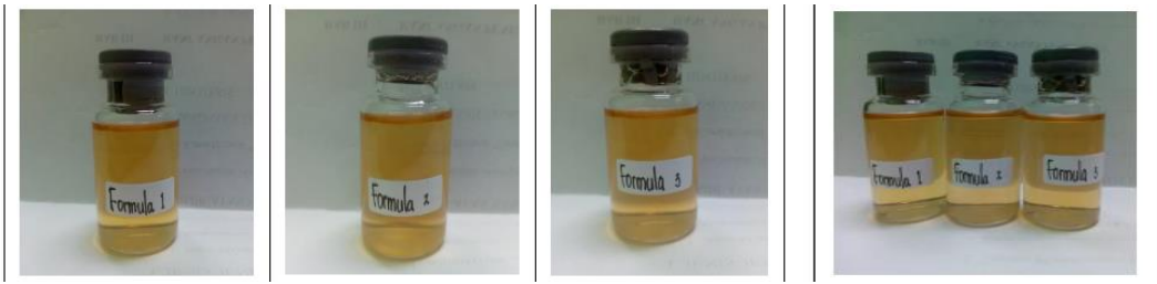
Day 1 (no precipitation) Day 30 (no precipitation) Figure 2. Physical stability of ethanol extract loaded gelatin nanoparticles of F1, F2, and F3 at room temperature.

The above results showed that Cantigi leaf extract can be made into gelatin nanoparticles; the smaller the concentration of the polymer used and higher the concentration of the glutaraldehyde, the smaller the resulted particle size and increased antioxidant activity. In general, the particle sizes were less than 100 nm, and these complied with the FDA standard. Polydispersity indices were between 0 and 1. These meant that the dispersities were still good. Unfortunately, the zeta potentials of the gelatin nanoparticles were too low, close to zero. These could mean that the stability of the gelatin nanoparticles would be affected. But, the use of surfactant such as Pluronic F-68 had enhanced the stability of the gelatin nanoparticles indicated by no precipitation and no change in color for 30 days (Figure 2). Nanoparticle morphology was spherical (Figure 3). This morphology was still in accordance with many previous studies on gelatin nanoparticles (Khan, 2014).