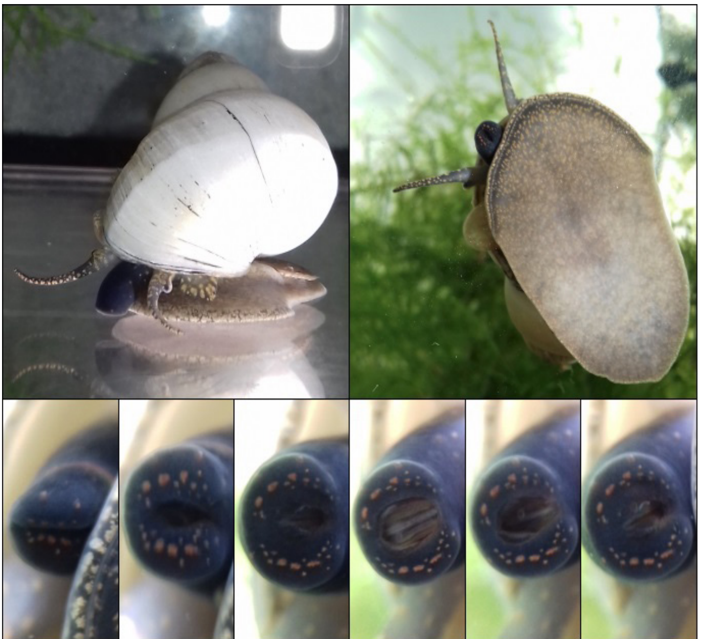
Figure 1. Filopaludina martensi martensi Frauenfeld 1865

In order to overcome this problem and establish the proper laboratory conditions for care and breeding F. m. martensi snails, several experimental setups are underway; long-term maintenance at different pH (5 and 8), water hardness, and various food. Local mud sample (a generous gift from Dr. Duangduen Krailas, Department of Biology, Silpakorn