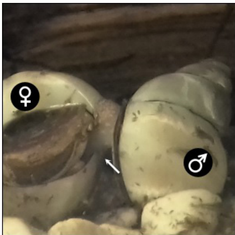
Figure 3. F. m. martensi copulating couple. The penis of the male animal is clearly visible.