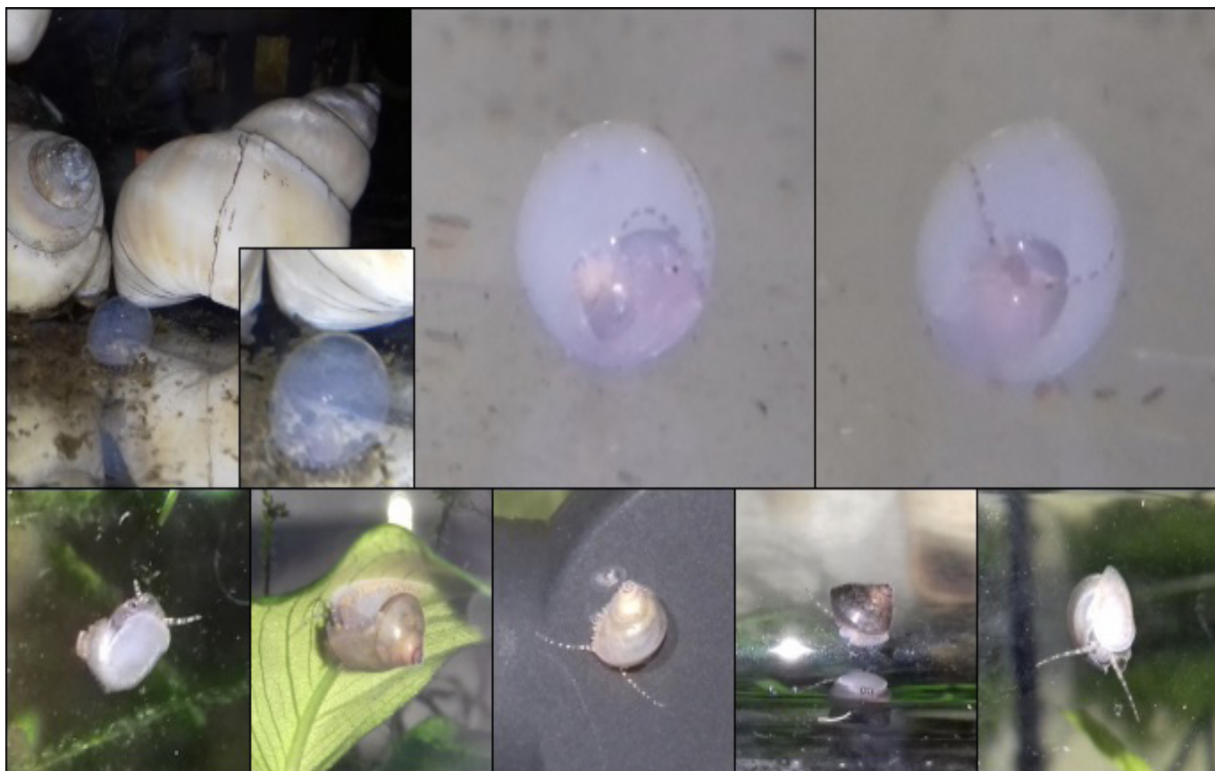
Figure 4. F. m. martensi juveniles. 3-4 juveniles were born regularly, every month or two, regardless of the time of the day. Inflatable (several hours after the birth) transparent lightly bluish spheres 5-6 mm in diameter are released in which the fully mature juvenile moves, and leaves several hours later after the sphere breaks.