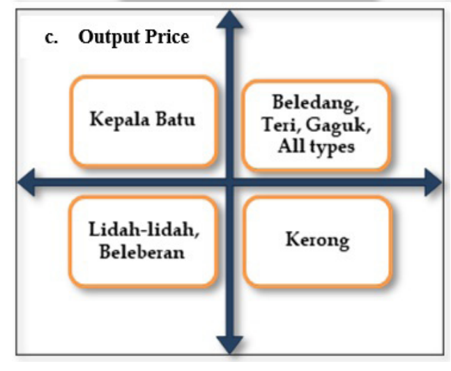
Figure 2. Risk event mapping of the availability of fresh fish input, input prices, and output prices

The availability of raw materials, namely fresh fish, was found to be below the limit of the amount of risk that could be tolerated by dried fish producers per production process. It showed that the availability of dried fish input could lead to a serious problem for producers since the quantity produced is still below the production capacity. Fortunately, not all fish species