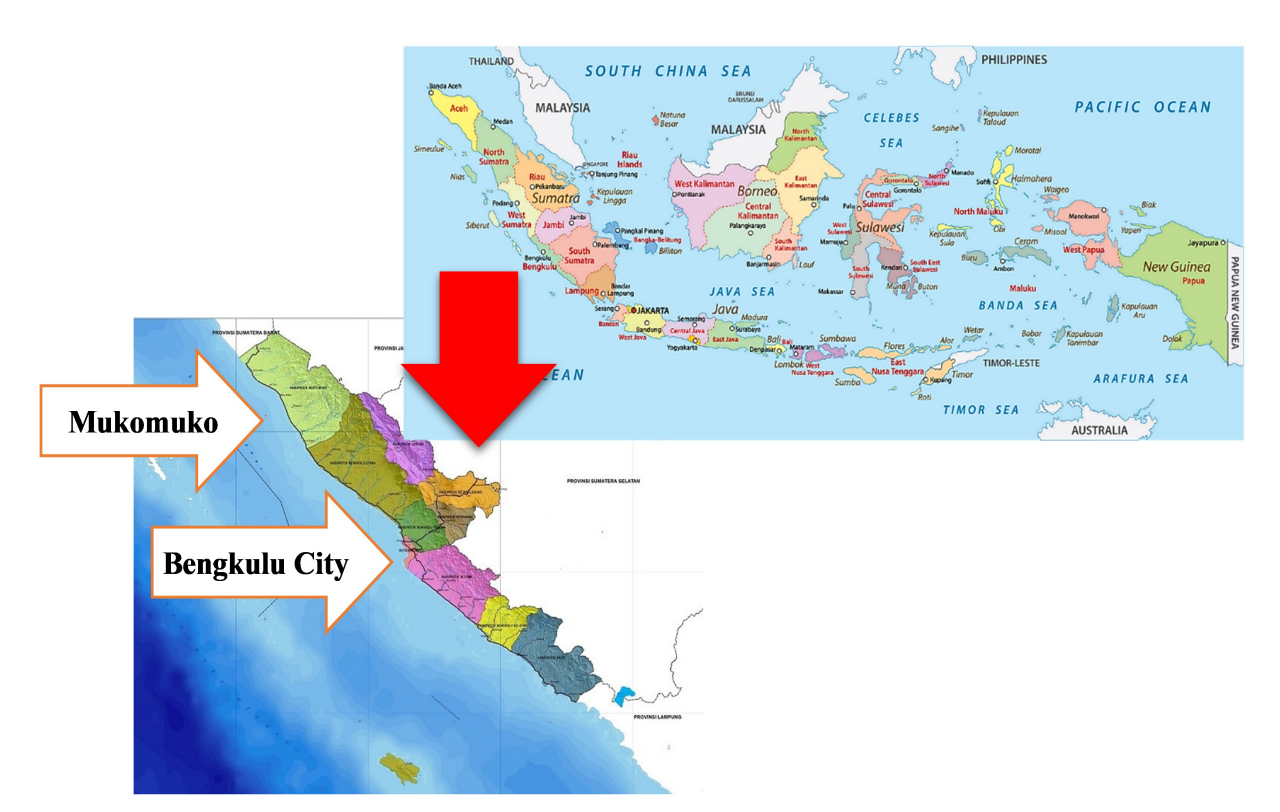
Figure 1. Research location

The discussion above will lead to the importance of studies aimed at developing strategies to adopt an effective risk management system in the salted fish household industry in Bengkulu. Related to this goal, this study is aimed at identifying the source of risk, analyzing the probability and impact of risk occurrence, and designing alternative risk management strategies.