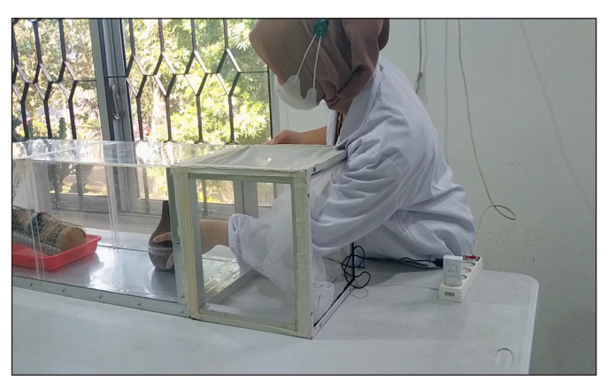
Figure 2. Test Cage Layout for Observation

Essential oil testing performed on mosquitoes was prepared as in figure 2. Testing of citronella, lavender, and rosemary essential oils was carried out alternately. In the preparation process, there was no significant color difference between the three essential oils but all three had distinctive aromas. As the observation progressed, essential oil vapors from the humidifier filled the enclosure space as can be seen in figure 3.