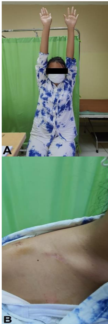
Figure 3. (A) The patient regained full shoulder range of motion on the two-week follow-up after the wire removal surgery with (B) Minimal post-operative scar.