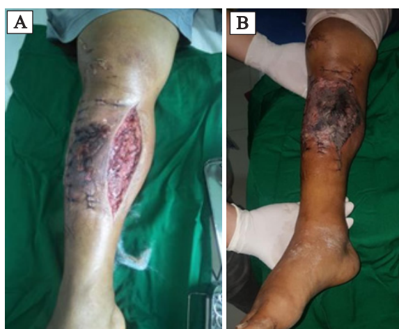
Figure 2. Clinical view. (A) After open reduction and internal fixation. The wound was found at the surgical incision at the proximal medial of the leg, and the size was found approximately 5x5 cm with muscle as the base of the wound. (B) 4 days after open reduction and internal fixation, there was a necrosis of the surgical wound.

The patient was then surgically treated with open reduction and internal fixation with T-plate 8 holes and six screws on the right lower leg. A counter incision was made on the medial side due to the difficulty of closing the wound. Four days later, the surgical wound was necrotic on the anterior aspect of the leg between the two incisions (Figure 2 A & B). The laboratory examination was obtained and showed leukocytosis with neutrophilia. He underwent debridement, medial gastrocnemius muscle flap, and split-thickness skin grafting. During surgery, there were nonviable tissue and pus on the wound. The pus and tissue culture were obtained. A broad-spectrum antibiotic, ceftriaxone 2 gr, was used as empiric treatment. The microbiology report then showed Klebsiella pneumoniae infection. Based on the sensitivity test that shows the microbiology is sensitive to Levofloxacin. Therefore, the antibiotic was changed into Levofloxacin 500 mg/12 hours intravenously. The patient was discharged five days after surgery with