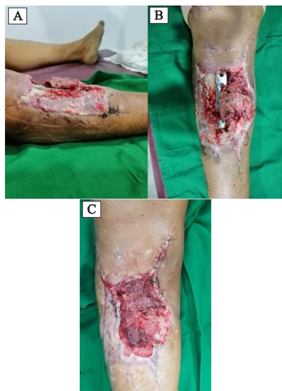
Figure 3. (A&B) Open wound with bone and plate were exposed. (C) Clinical picture after the second debridement, gastrocnemius flap, and skin grafting.

After two weeks, the condition was not getting better, so the patient underwent surgical debridement. The wound was found with approximately 5 x 5 cm with bone as the base of the wound. Dissection and re-elevation of medial gastrocnemius muscle flap were done to cover the exposed plate area in the inferior. A split skin graft (donor from the right femur in anterior) was applied above the muscle flap. There was no intervention to the bone plate fixation because it was stable and loosening. There was