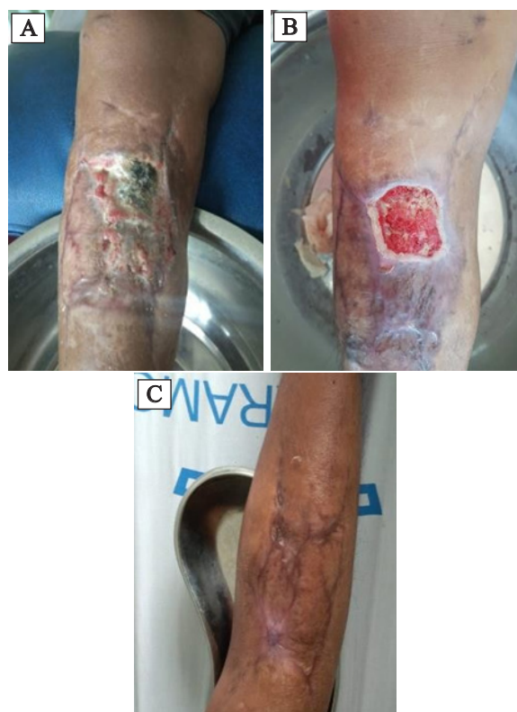
Figure 4. Wound healing at (A) One month, (B) One month, and two weeks, and (C) Four months after the operation.

One month after the operation, the inferior part of the wound was healed first, and two weeks later, the patient came again with granulation on the superior part of the wound (Figure 4A & B). Four months after the last operation, the wound had fully healed, and the patient could fully weight-bear. We found that the wound's infection was handled well