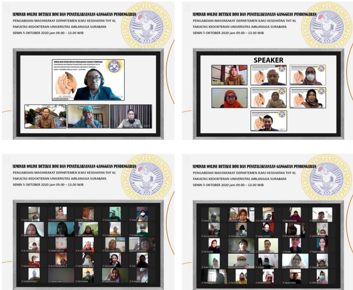
Figure 2. Online Seminar Activities on Early Detection and Management of Hearing Loss