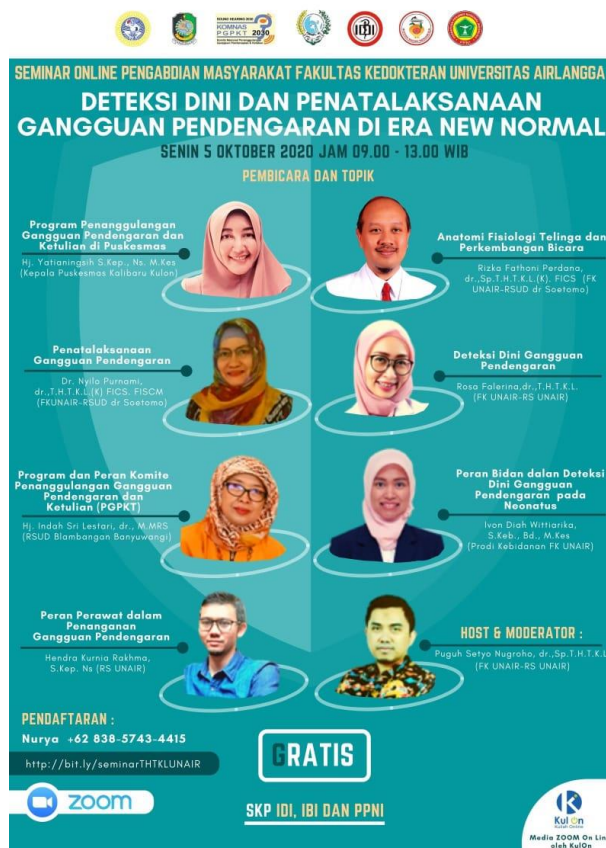
Figure 1. Online Seminars on Various Aspects that are related to Early Detection.

The online education method was carried out in the form of a seminar with the theme of early detection and management of hearing impairment and 1.484 participants attended it with 363 doctors (24,46%), 697 midwives (46,96%), and 424 nurses (28,58%).